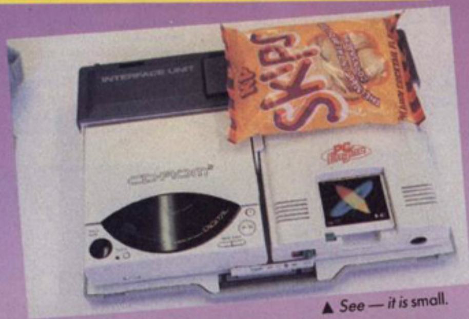
▲ See — it is small.