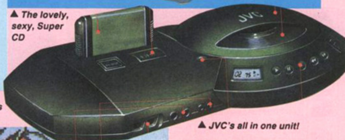
▲ JVC's all in one unit!

Smart animation is one of CD ROM's advantages ▼