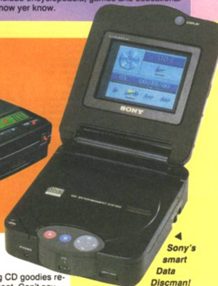
▲ Sony's smart Data Discman!