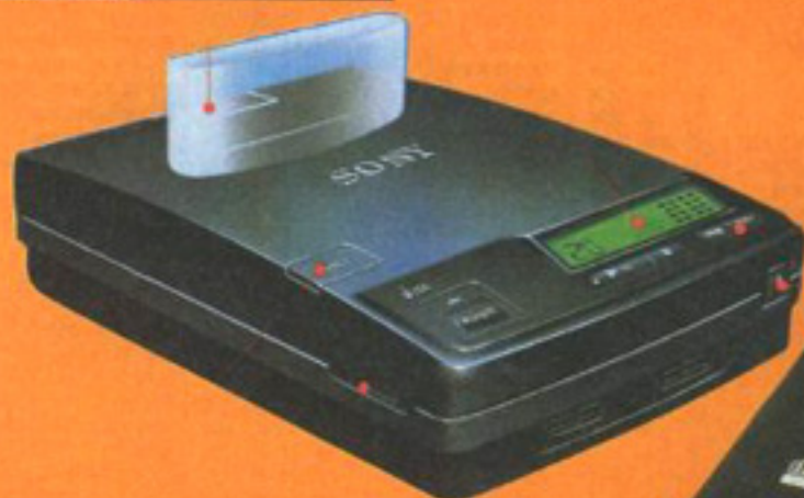
The sad Sony Playstation may get left by the wayside. ►