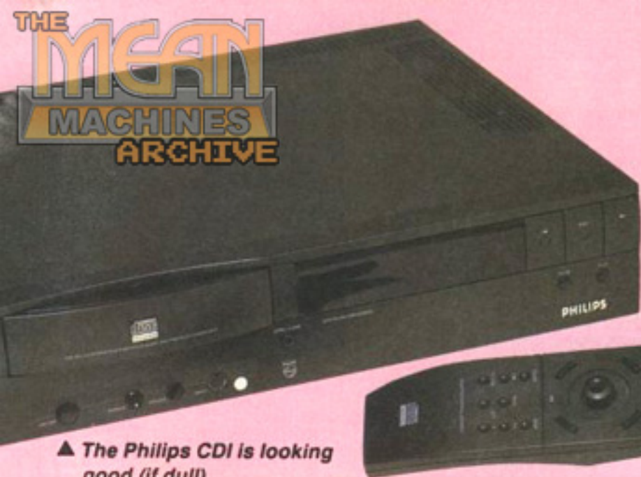
▲ The Philips CDI is looking good (if dull).