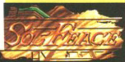
▲ Sol Feace on the Mega CD.