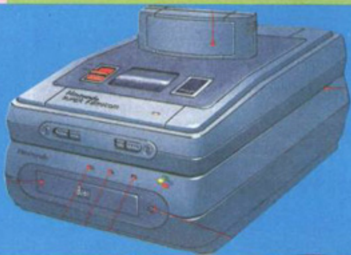
▲ The lovely, sexy, Super CD

So now all you prospective Super NES owners know what the CD unit will look like and what it's capable of. Are your trousers still dry? What's wrong with you!