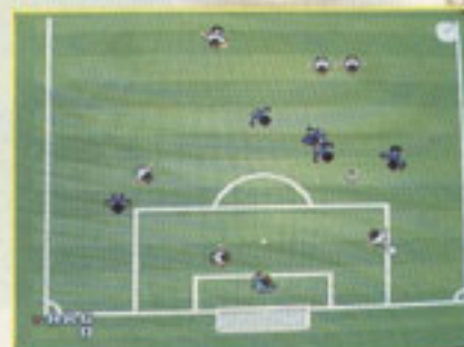
▲ Italy moves into a striking position.