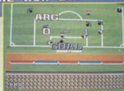
▲ The Argies go one down - oh no!

While choosing a team, it's possible to check out their stats. This helps to make the decision, choosing a team that compliments your playing style. The four statistics that are shown are: Offence, Defence, Speed, and Kick. These are rated out of five, and Brazil, Argentina, Italy, and the Soviet Union are among the best teams to choose.