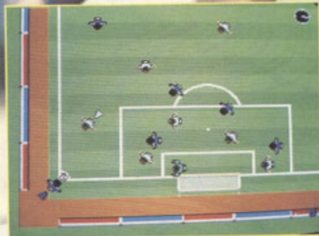
▼ Corner kicks are not as easy as they look!

World Cup Italia 90 looks good when you load it, since it features some excellent presentation screens. However, when you play the game itself, disappointment is the order of the day. The graphics are dreadful and the pitch is so tiny, you've got no room to manoeuvre. Control is very poor - you can plough through the opposition, shoot diagonally and stick it into the net easily! And that's not all. The graphics are all out of scale (the men are nearly as big as the goal!), the ball movement is utterly unrealistic and the sound is dreadful. In fact the only thing that's good is the penalty shoot out! If you haven't got a football game, get the vastly superior (and cheaper) World Cup Soccer. Otherwise wait for something better.