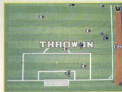
▼ Time to state the obvious.