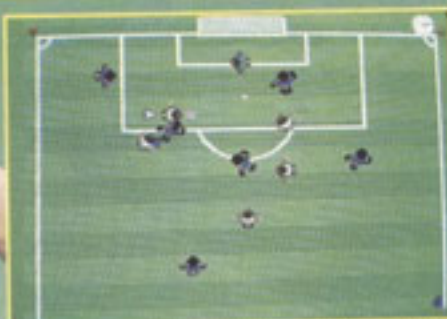
▲ Where are the rest of the players?

Football games are traditionally a hit-or-miss affair, and I'm afraid this is definitely a miss. I suppose it could be said that I've been spoiled by World Cup Soccer, but this game is awful by anyone's standards. The graphics are all right, but why only eight players per team - and why such a minuscule pitch? The control is appalling and awkward, with no discernibly easy way of making the nearest player chase the ball; at least not until the opposition has got there first. When possession is gained, however, it's simply a question of running towards the goal. Your opponent stands next to no chance of halting your progress. A football game that does not reward skill easily is no football game at all - and sadly, that's the case here.