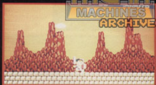
▲ Wonderboy in his "normal" form - this is how you start the game.