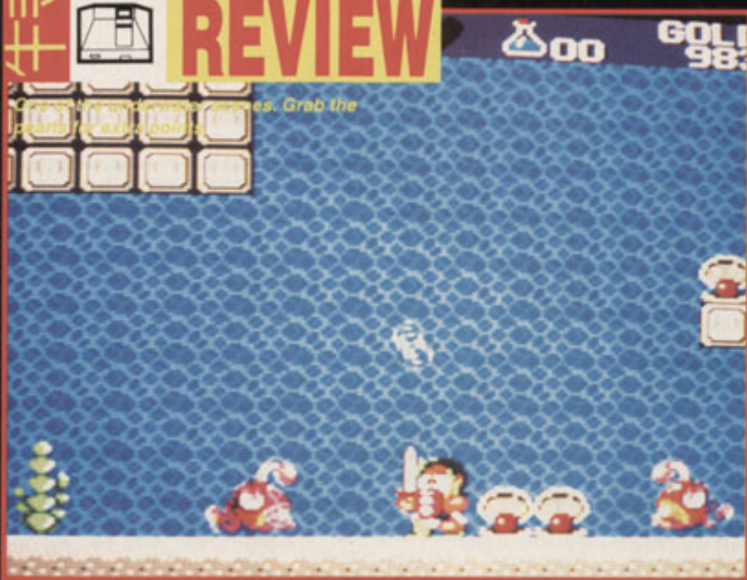
▲ Collect the gold coins and power-ups. Grab the power-ups for extra points.