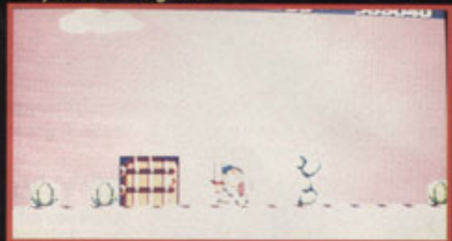
▲ Each door leads to another subsection of the game. Check all of them carefully!