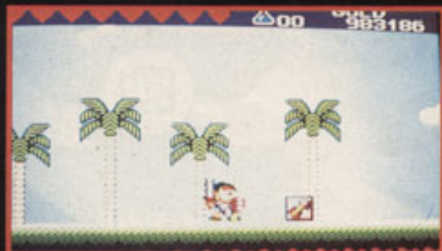
▲ Power-ups litter the landscape - collect the set!