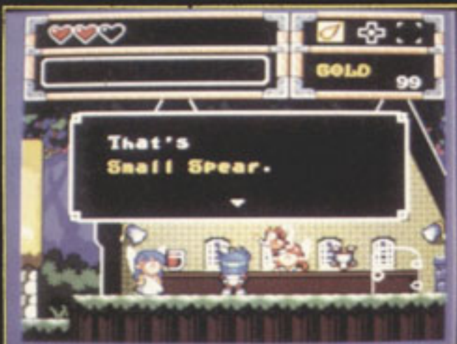
▲ Wonderboy gets toolled up