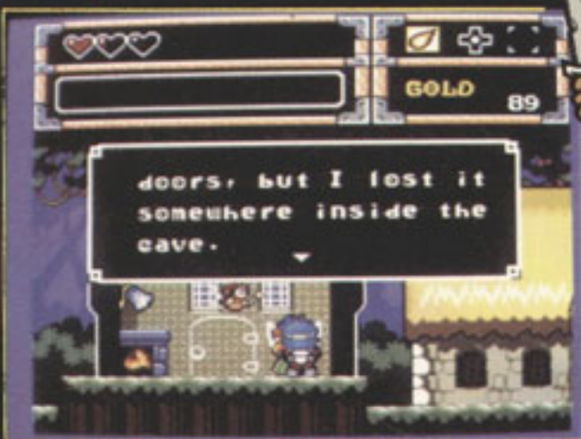
▲ Each character in the game has a unique line of conversation.

JULIAN both absorbing and addictive - all thanks to the marvellous playability. The challenging platform action and the tricky but logical puzzles combine together with the game's enormous size to give massive depth of gameplay. There's tons to discover, and the game's many original features and novel concepts keep you playing just to see what's around the next corner. If you're looking for a platform game that'll keep you playing for weeks rather than days, this should be put at the top of your list.