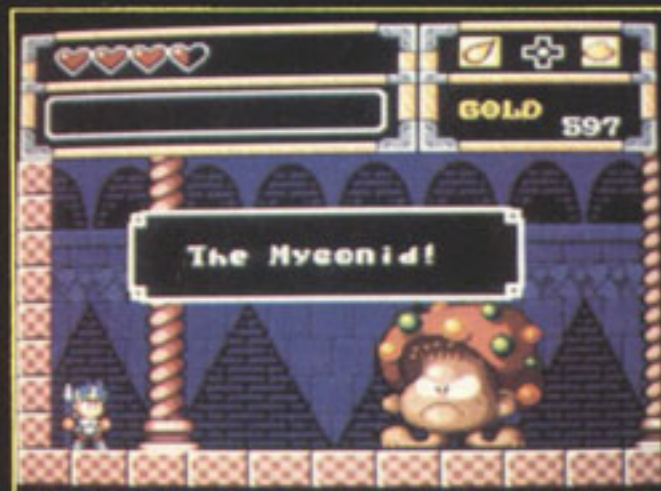
▲ Wonderboy versus Miconid!

Still, he's still got all his sword-swinging platform-jumping abilities intact, and you can be sure he'll be using them to their full extent in this, the fifth installment of the Wonderboy saga.