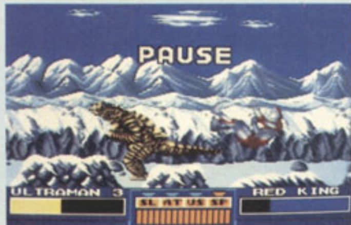
▲ The mean, strutting Ultraman - in combat!

But there are ten evil monstrosities awaiting our metallic hero.