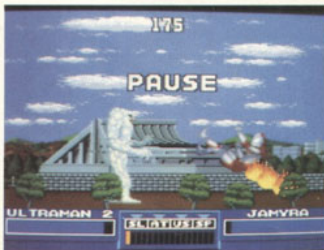
▲ A bad case of repellent breath.