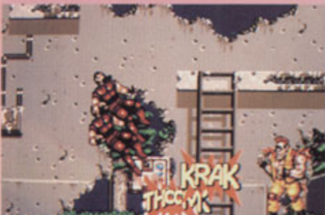
▲ It's Crude Dudes double whammy.