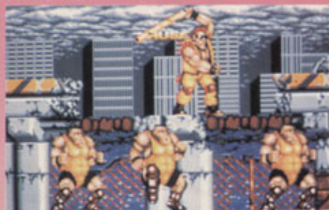
▲ It's fat girls on a stick.

Using your kick-ass skills and immeasurable strength, it's your aim to bring down the small, frail scientist and his minions before they completely take over New York!