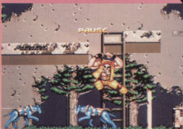
▲ Beware the nipple-biting dogs of doom!