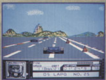
▲ Watch out for the cones left by the maintenance men!