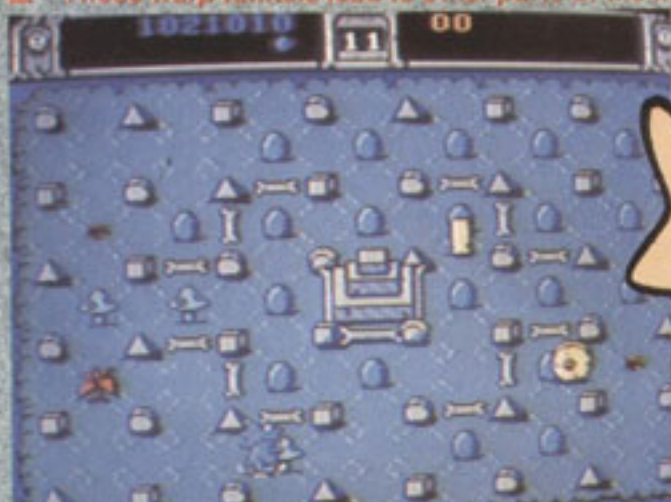
▲ Collect those eggs, Bloop - NOW!