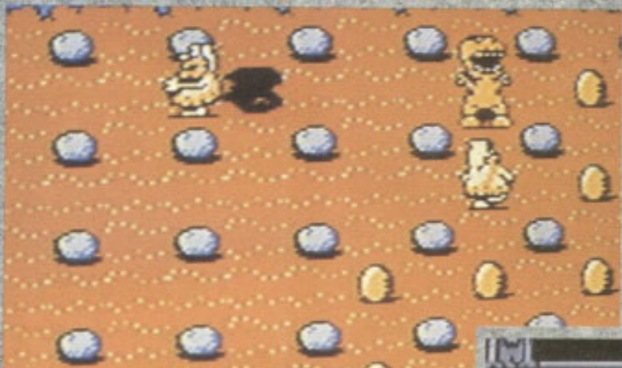
▲ Close-by meemies get the fist treatment!

If you're an NES owner who's been steaming with envy over the Megadrive and Master System PacMan games, steam no longer. Trog is really just a PacMan variant with a few new bits bolted on to protect it against the lack of variety which was the downfall of the original PacMan. Graphically Trog is nothing much to speak of, and the sound is also inoffensive. The gameplay is quite fun, with plenty of eating and teleporting action, although you do tend to fall off the edge of the island with no warning when things get hectic. In the end, though, despite all the additions, Trog still lacks enough action and variety to make it really special. Undoubtedly, it's a great conversion of the coin-op, but only Pac-fans need apply.