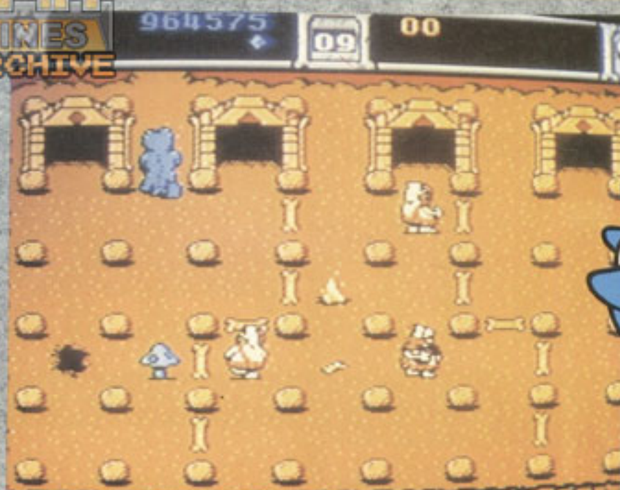
▲ It's pac-style action in Trog, as you can see.