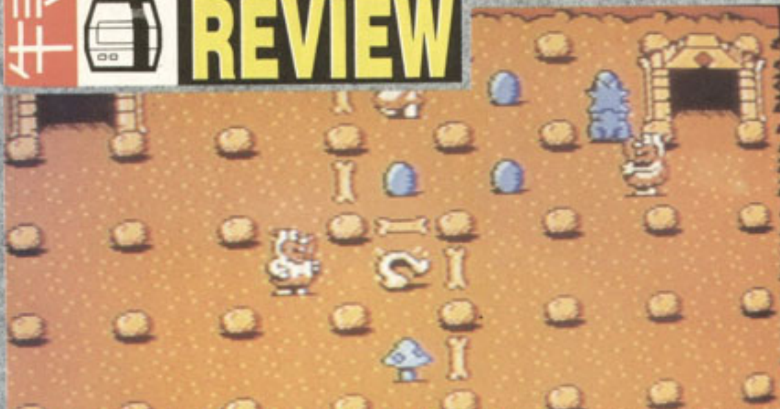
▲ Those warp tunnels lead to other parts of the maze.