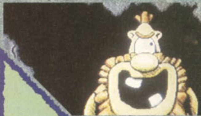
▲ Meet God's gift to women.

Trog is very much like a battle version of PacMan. Your small Dino-mite legs it around the islands dodging and biffing the aggressive cave-men and munching their eggs. The going gets a little tougher later on as routes are blocked off with dinosaur bones, meaning teleporters and catapults must be used to reach some parts of the island!