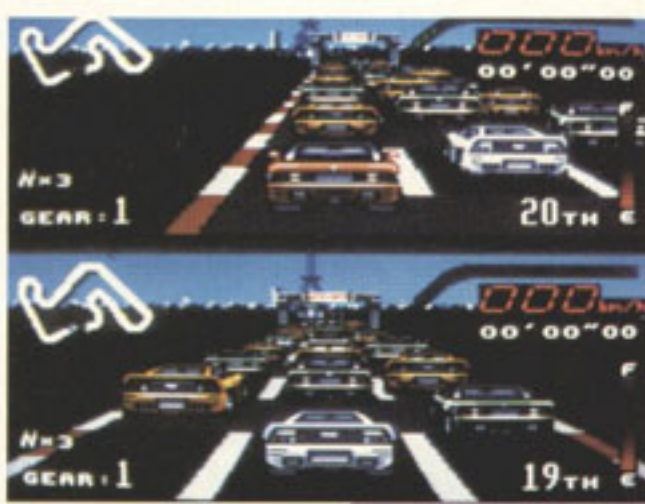
▲ The races move on to Paris (note the Eiffel Tower in the background)! The red car takes on the white in an all-or-nothing race for Top Gear supremacy. White has the slight advantage of starting a position ahead.

Do you reckon you have the driving mettle of a Mansell? Or is the sluggish speed of a shambling Skoda the best you can achieve? Check out Top Gear and see for yourself!