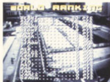
▲ Check out the world rankings in Top Gear! Reckon you're good enough to reach the top?