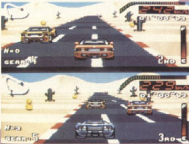
▲ It's a close one here in the Sahara Desert, as the red car uses his speed advantage to pull ahead.