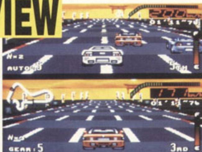
▲ A wide road here should cause no problems for Top Gear players. Burn rubber!

Top Gear is a split-screen road racer (as you most probably figured out for yourselves by looking at the many pictures on the page). In one-player mode, the computer occupies the lower screen providing a stiff challenge to the player. In two-player mode, the second participant uses the lower-half of the screen. The screenshots cannot convey the sheer speed of the game, or the incredible fun of the two-player mode!