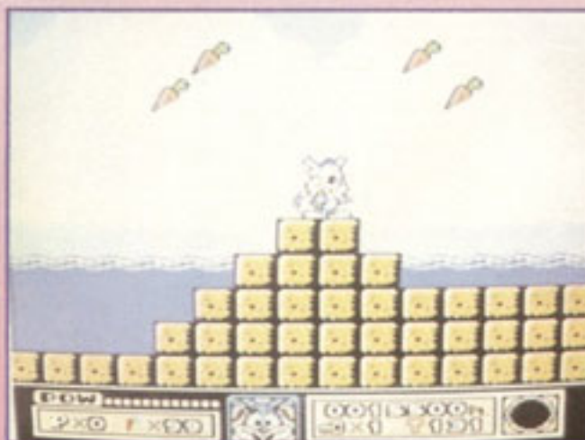
▶ Oh dear, it's a mouse.

Everyone who owns a cat knows how they love to dig their claws right into your lap as a sign of affection. Furball digs his into the walls instead which allows him to scale them. It also means that he can save himself on cliffs, where the other characters would perish. Boomtown, stage four, is where he is most in his element.