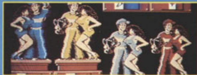
▲ A serious case of cloning in Super Off Road.