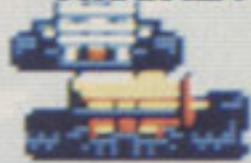
▲ Burning up a computer car!