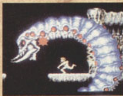
▲ Terrifying boss, eh?