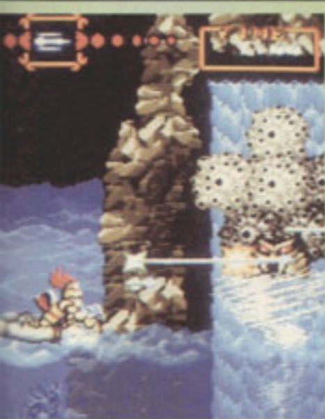
▲ armour's power spells doom!

GREEN ARMOUR: Don the green armour and watch your offensive weapon double in power, gaining mystical laser-like qualities!