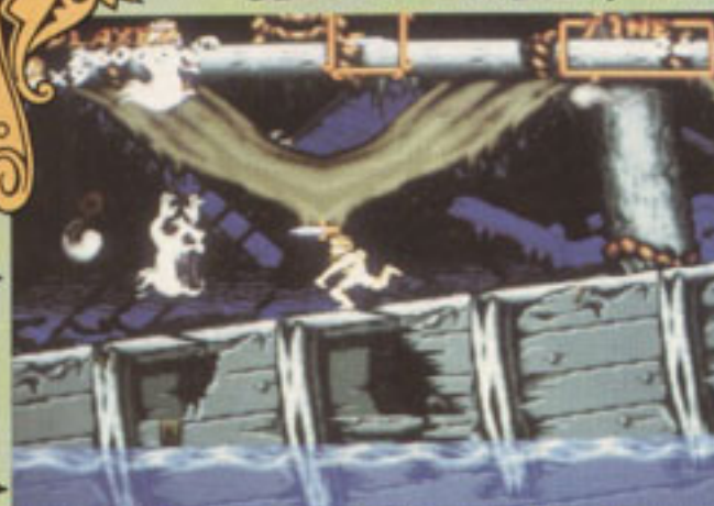
▲ Messing about on the river turns deadly...