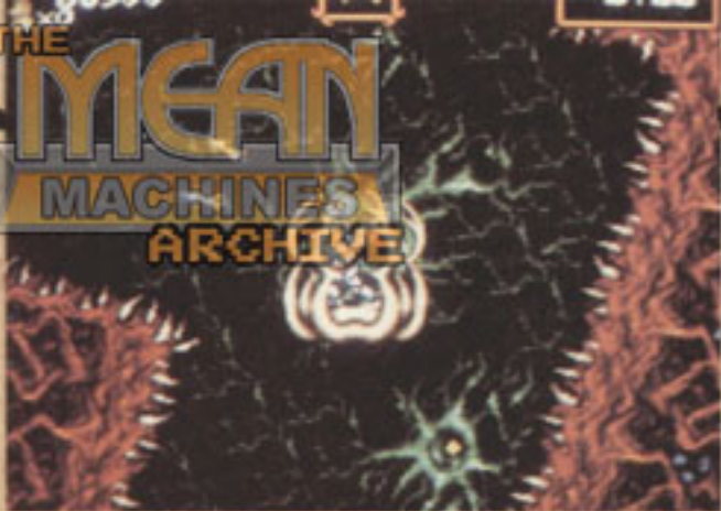
▲ Lovely backdrops, huh?