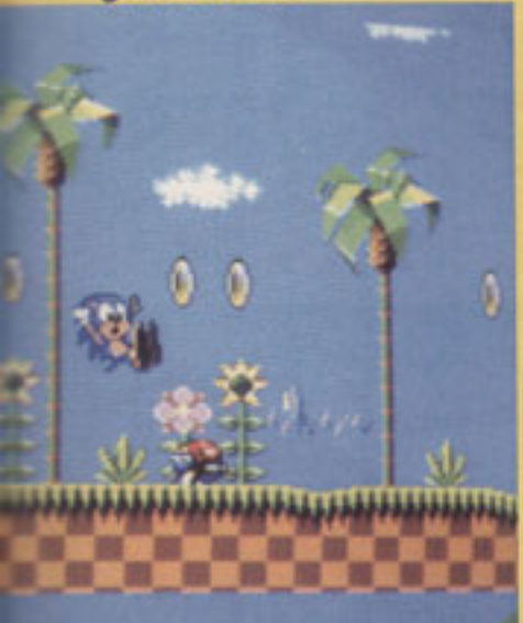
▲ Sonic receives a nasty surprise.