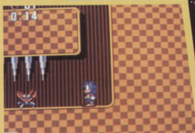
▲ Those spikes are deadly to the touch.