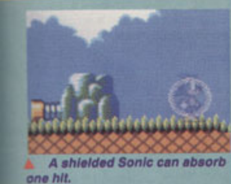
▲ A shielded Sonic can absorb one hit.