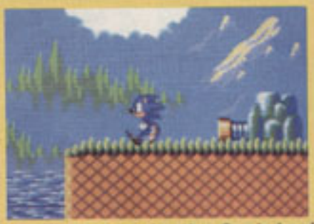
▲ That spring hurtles Sonic back.