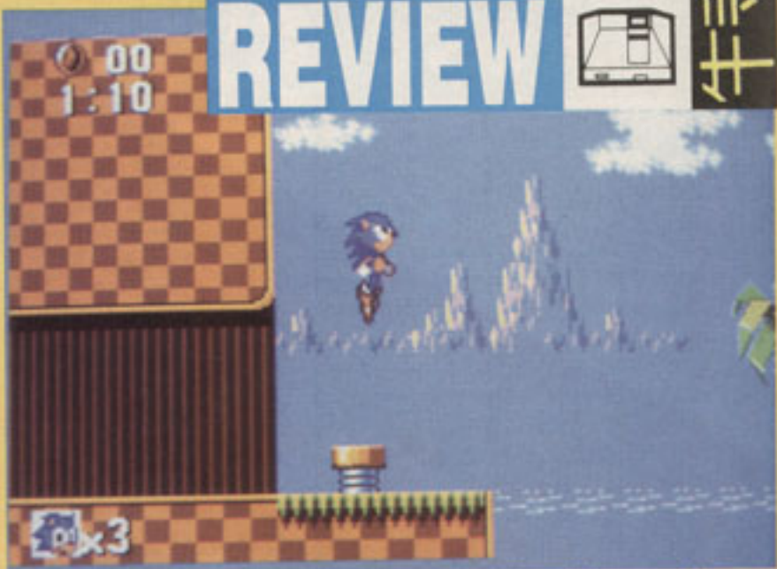
▲ Those springs come in handy for reaching some of the higher platforms.