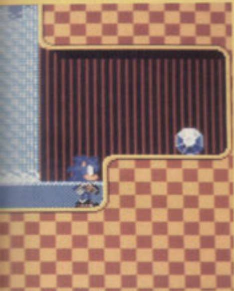
▲ An underground level greets Sonic.