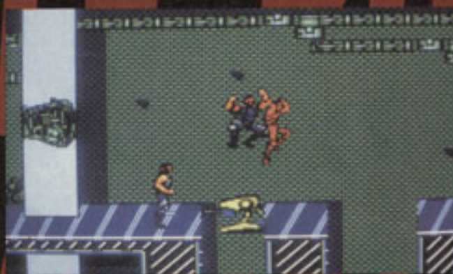
▲ Gray is able to whip out his firearm at will!