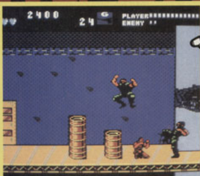
▲ Leaping enemies accost Sergeant Gray in this fun-filled, action-packed adventure.

Should you chance across a fine SS icon, Gray is immediately endowed with a Super Suit. This boosts his attack strength fourfold, and makes his defensive moves twice as effective. The best icon to find is marked SR. The effects of this are dramatic. Gray's running speed becomes near lightning speed and he won't fall through holes in the scenery! As an added bonus, Gray is also invincible and enemies die on contact. Watch it though - there's a strict time limit for your killing spree.