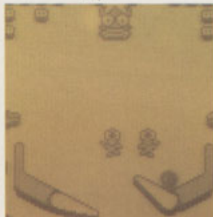
▲ Hit these squares in order to reveal doors to hidden areas!

This is a pinball game with a difference! An elongated (pun intended!) table, with secret bonus areas and plenty of point-making bumpers, is the setting of this game. An alligator theme runs through the table, including baby 'gators that appear on later stages.