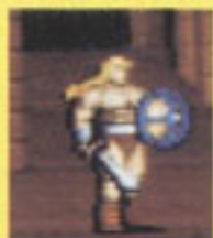
SWORD OF STEEL

As the Brave One slashes his way through the multitude of levels his sword is bound to suffer some wear and tear. Fortunately he is rewarded now and then with a new sword which is bigger and more powerful than his standard one. Should the Brave One sustain a hit he drops it, but he can pick it up again providing he does it quickly. It is even worth jumping into fire or spikes to regain the sword because it proves invaluable, especially when fighting bosses. There are six swords in all, of which the most powerful is the Sword of the Thunder God.