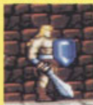
SWORD OF THE EARTH