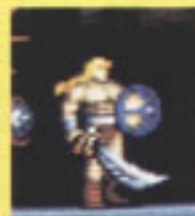
SWORD OF THE SUN