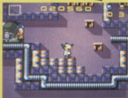
▲ Sideshow Mel operates the cunning device that disposes of the rats during this colourful level.