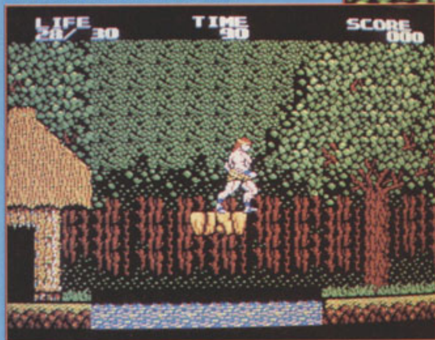
▲ Platform: climbing romps all the way!

Talking to characters in the game provides clues and hints for later levels. With a boss at the end of each level, a tough challenge is certain!