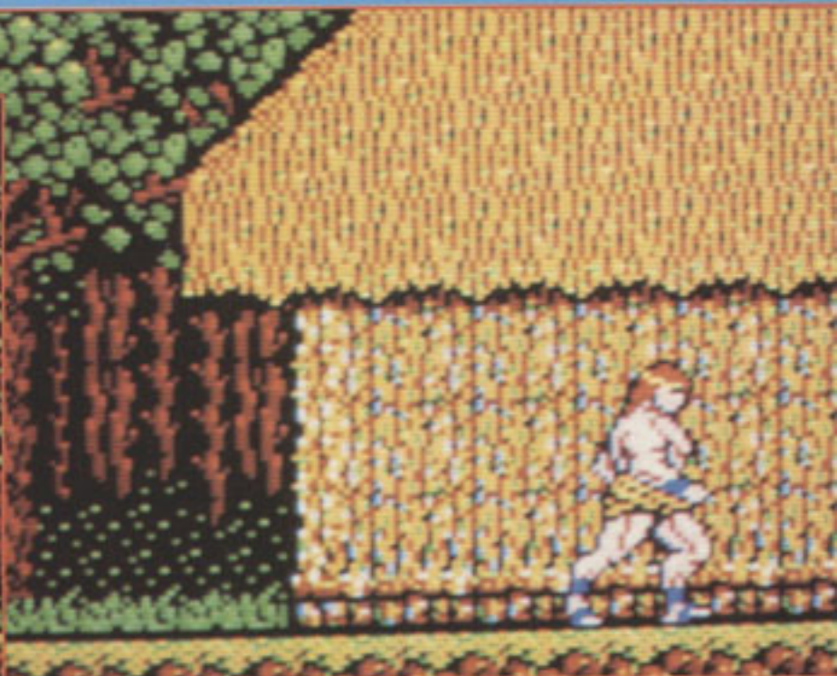
▼ Have an interesting chat with a squatter.