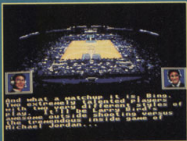
▼ Some lively banter from the commentators.