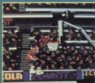
▲ Some ace slam-dunking thrills here as Jordan tucks the balls away.