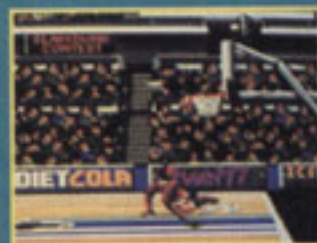
▲ Two shots depicting slam-dunk action. The picture to the right shows the practise round.