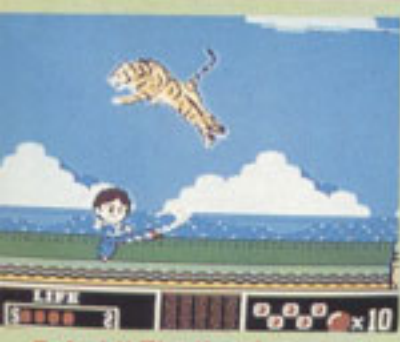
Behold! The tiger!