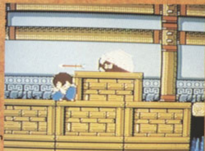
Corrupted with a bit of a close shave!