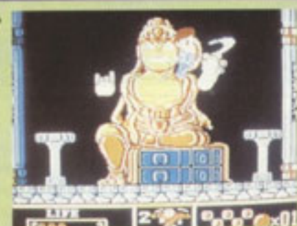
▲ A spinning kick!