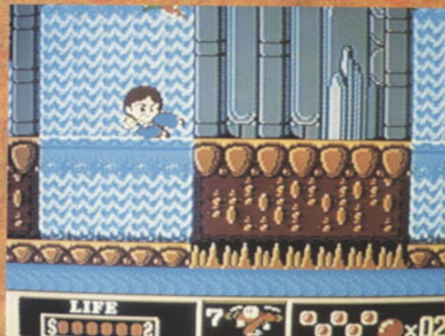
▲ Jackie kicks ass in the water level.