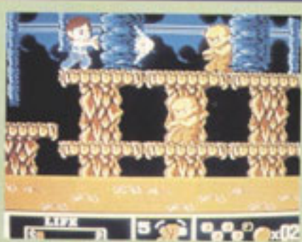
▲ Jackie fires missiles!