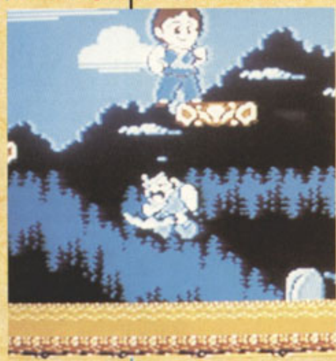
Jackie faces up to an evil boss!