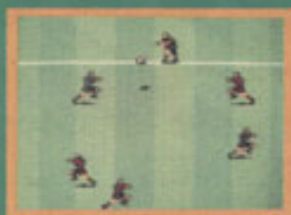
▲ High scoring game between Germany and Columbia(!).