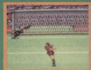
▲ More ruthlessly efficient German football.