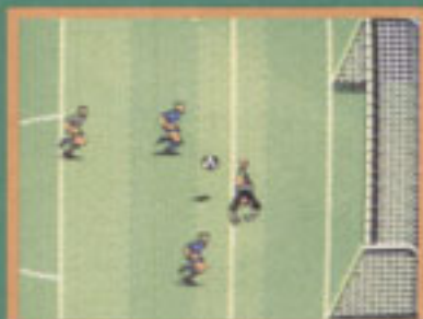
▲ England launch an attack on the Dutch.

This move, like the bicycle kick, depends on timing and position. It is often safer to attempt a header, but if caught right it's likely to hit the back of the net before the keeper knows what's hit him.