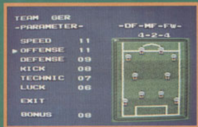
▲ The Hun decides on how to humiliate opponents.

Once a team has been picked, an options screen appears with information on the teams' strengths. It gives the player the opportunity to improve on their side's speed, offensive and defensive capabilities, kicking power, overall technique, and (very sensibly) luck. Bonus points are awarded with which to do this, so deciding on what areas to improve depends on the teams weaknesses and the strengths of the opposition. There is also the chance to chose the teams formation here.