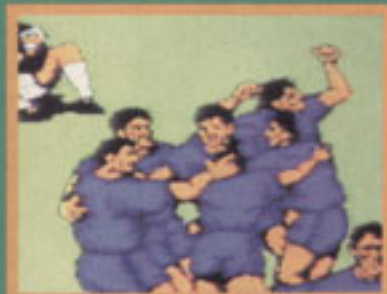
▲ Taylor's donkey tactics pay off!