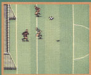
▲ Keepers ball! Keepers ball!