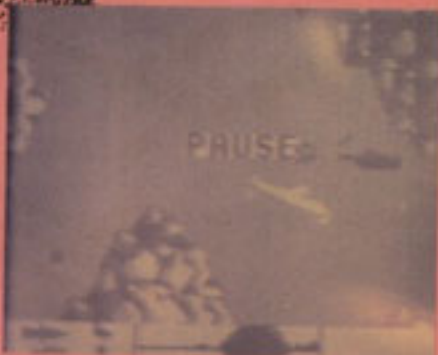
▲ The Red October kicks submarinal ass!