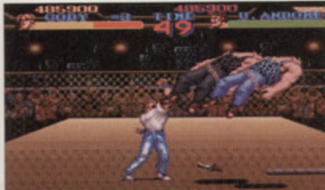
▲ Cody makes light work of the Andore brothers.