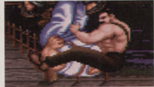
▲ Haggar demonstrates the intimacy of wrestling!