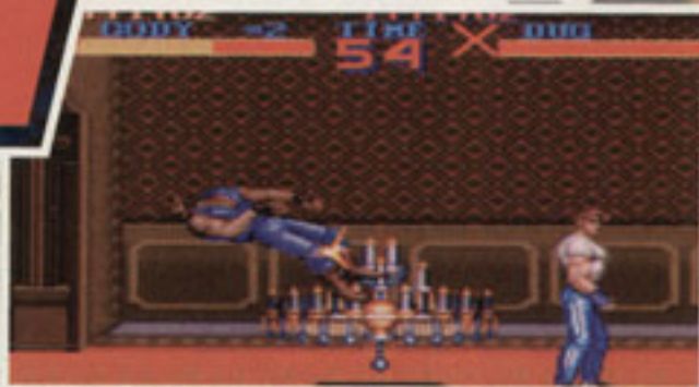
▲ Cody makes 'light' work of another of Mad Gear's cronies. ('Light work'—it's a chandelier seal).