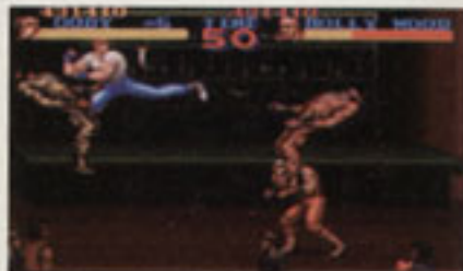
▲ Kicks to the face all round!