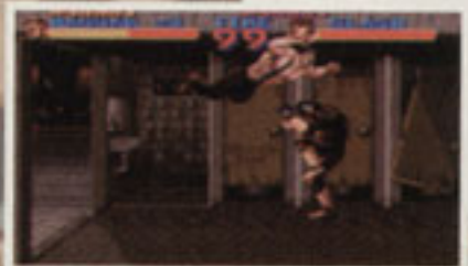
▲ The big man, Haggar, gives Axl a good seeing-to in the public lavatories on level four.