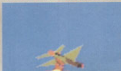
▼ A missile about to strike!

By using a combination of buttons on the jypad, all manner of different viewpoints are available. A full 360 degree wraparound effect can be achieved, along with a chase 'plane feature (this means you see your 'plane from behind, Afterburner-style). If you reckon that the view-screen is a tad on the small side, it's possible to remove it, leaving just your HUD (Head-Up Display) to provide you with useful info.