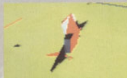
▲ An escaping pilot scraps the F-22's canopy!

concentrate on are the targets and enemy planes, and these are smooth, detailed and realistic! Wait until you've got five aircraft all hurtling around trying to stick a missile up your exhaust port! The sheer depth is incredible, and there are tons of missions to challenge even the most skilled of top guns! And even if you conquer them all, you can use the "create mission" option to engage in kamikaze laffs 'n' high-jinks. With its wealth of options, different viewpoints, brilliant touches (watch for sun glare and be careful the pilot doesn't pass out in combat due to excessive g-forces!), stunning presentation and challenging, thoroughly addictive gameplay, F-22 is not only another prime example of how advanced and complex console games can be, it's also a fantastic game in its own right. Test fly it as soon as possible.