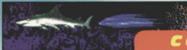
▲ Dolphins defend themselves with a bum's rush.