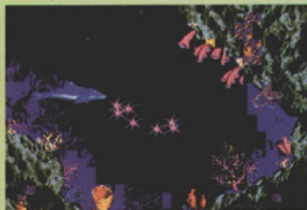
Dolphins have been observed playing with star fish, and Ecco has the power to manipulate their direction with his sonar pulse. They arrange themselves in floating spirals in the deepest crevasses.