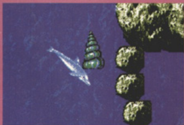
A harmless creature, this pointy-shelled mollusc has a particular habit of absorbing rock.