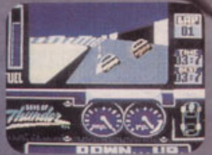
Hitting the corner hard.

Apart from Days of Thunder, our lad Tom has been in many films. Top Gun has been his biggest success so far, while Born on the Fourth of July won him major critical acclaim hot on the heels of Rain Man. However he's been in more frivolous films too; Risky Business was a teen sex comedy that was a big hit in America. Cocktail was a rather bland Cruise vehicle, while The Color of Money cast him opposite Paul Newman in the sequel to The Hustler. Days of Thunder did not do well at the box office or with the critics, who called it "Top Gun on wheels", basically because it has the same plot as his previous blockbuster.