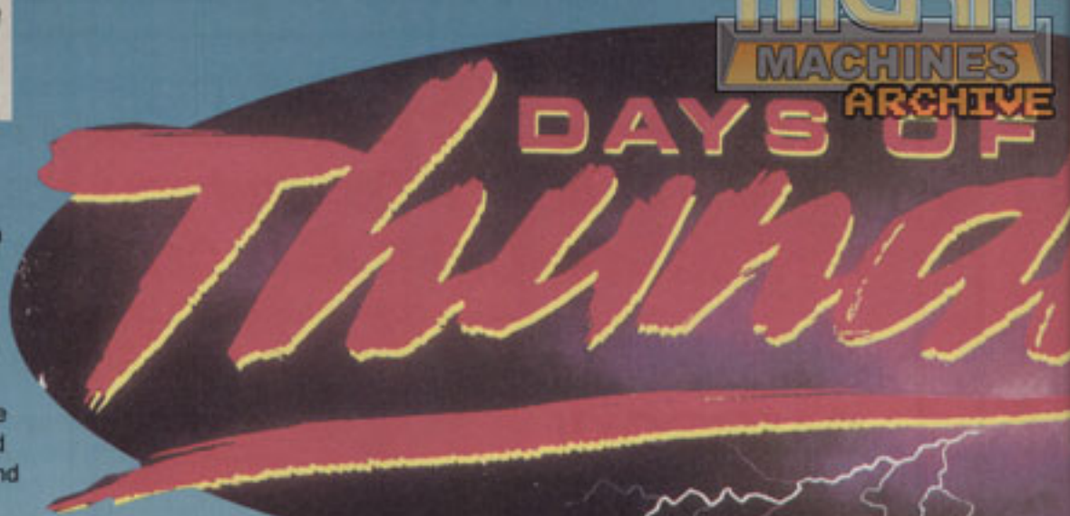
Defeat is not a pretty sight!

The buttons control the accelerator and brakes, but otherwise the player simply steers the car around the corners and overtakes the other vehicles.