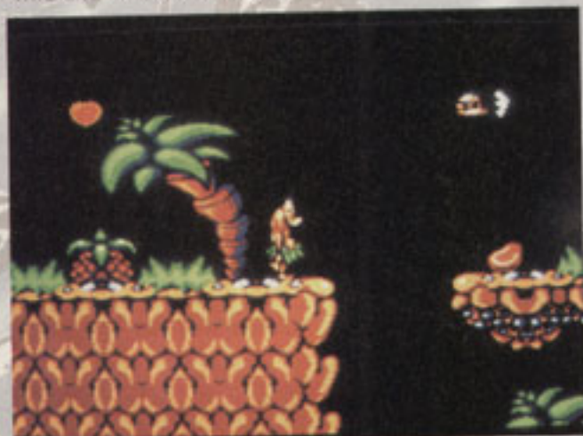
▲ The Gary Harrod lookalike struts around prehistoric Earth admiring the scenery.

Have you got what it takes to rescue Chuck Rock's wife from the clutches of evil?