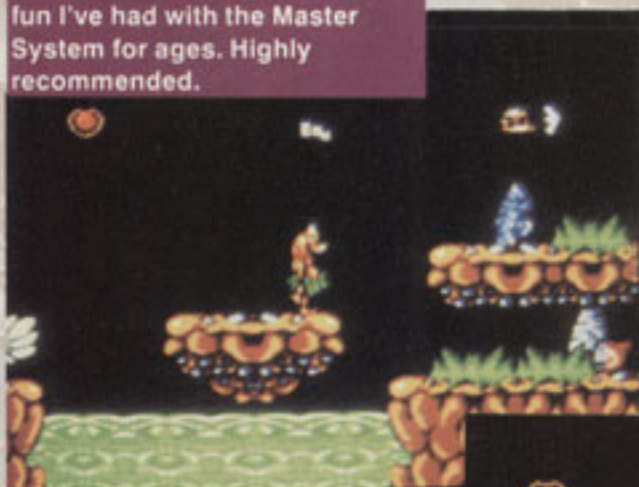
▲ Chuck ponders a problem.