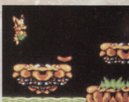
▲ A fine leap from Chuck.