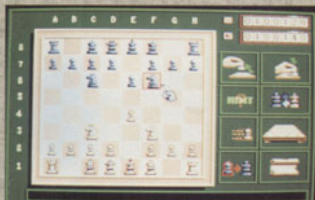
▼ The options screen is quite extensive.