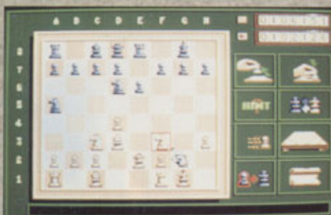
▲ Stuck? Try the hint icon.