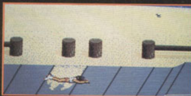
▲ Skate on down to the seafront - if you dare!