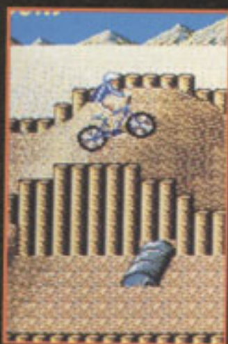
▲ BMX excitement on the dangerous dirt tracks...