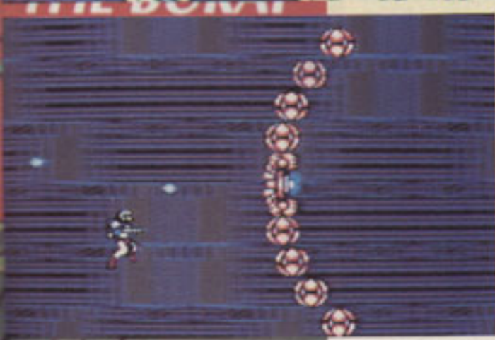
▲ The first guardian in the game.