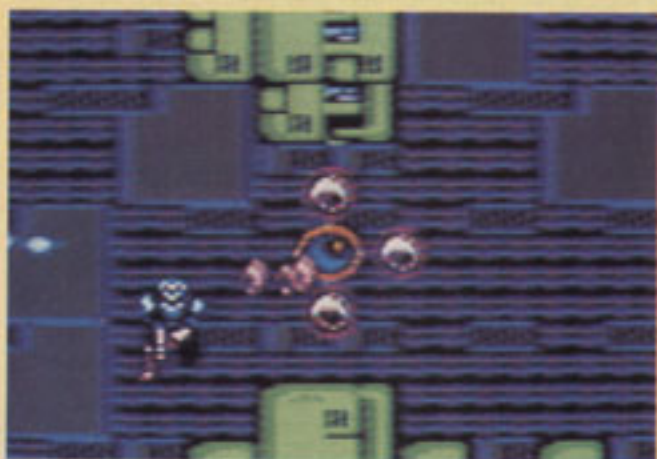
▲ Shooting this reveals a power-up.