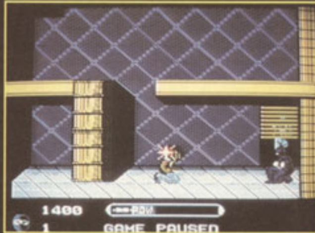
▲ He! He! Another baddie meets his maker.