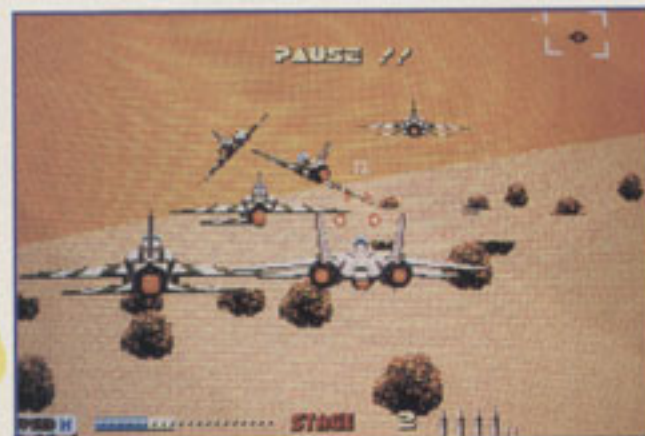
▲ Formation destruction!