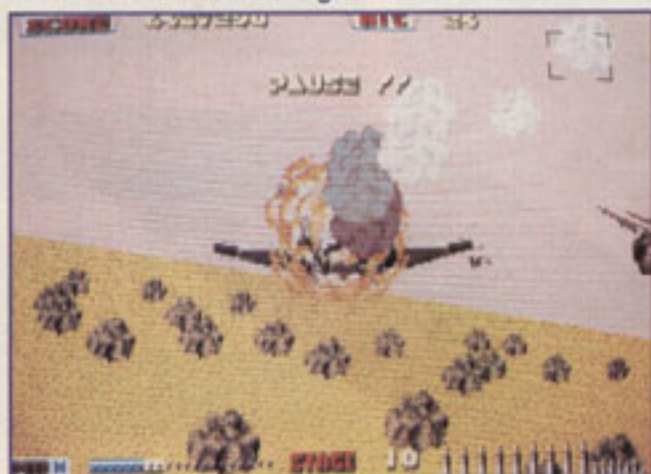
▲ The F-14 gets a napalm enemy!