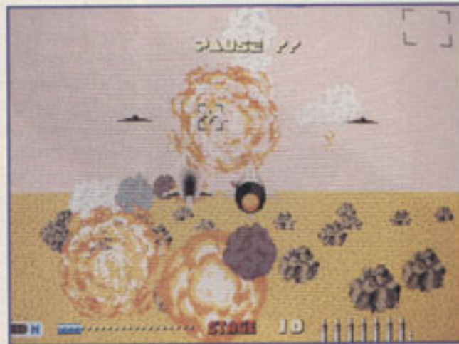
▲ A cruise missile causes F-14 annihilation.

Thankfully, Afterburner is more than pulls off this gargantuan feat. The graphics are less detailed than the coin-op, but the programmers have concentrated on making the action look superb rather than the scenery. The 3D effect on all of the planes is excellent and there are loads of big explosions to make the destruction that more appealing. The sound is excellent too, with sampled "speech" and effects and some of the best music I've heard on the Megadrive. The gameplay is repetitive, but the high-speed thrills 'n' spills offered by the game more than makes up for it. Afterburner is an excellent conversion and a superlative game in its own right that more than deserves a place in your Megadrive collection.