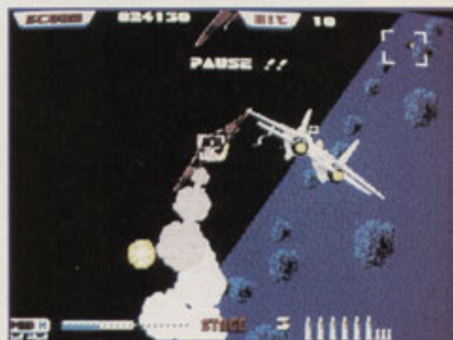
▲ Night-time flying in Afterburner.